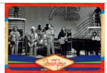
The Beach Boys on American Bandstand - Bobby Fig on drums (card from 2013 Panini trading card set)

(please do not re-publish these photos. These are being provided for informational purposes only to show the amazing history that CSI members have with the Beach Boys)