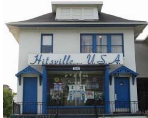
The original Motown recording studio and offices in Detroit, MI :: HITSVILLE USA